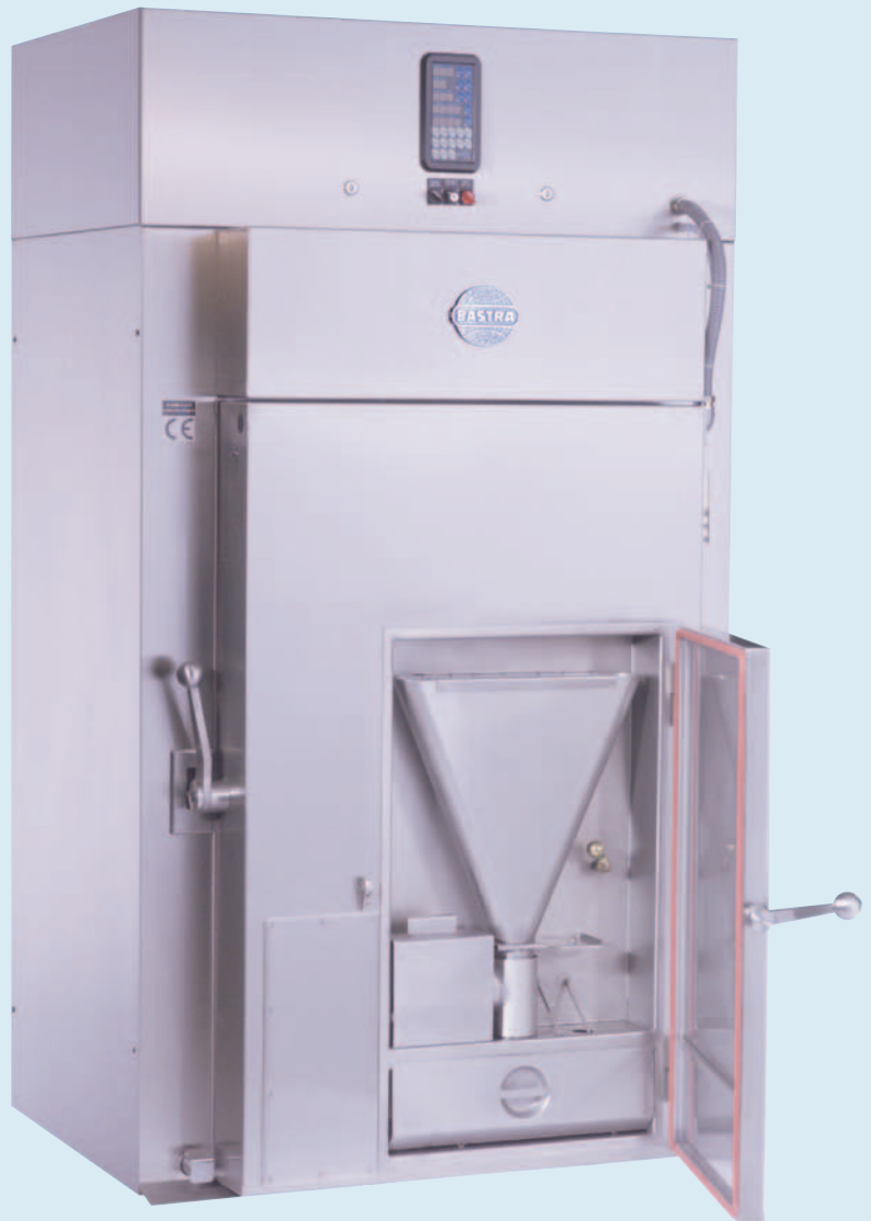
Fig. Modell BASTRAMAT 851 TF