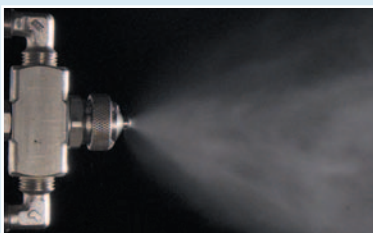
Fig. BASTRAMAT 2000 FR