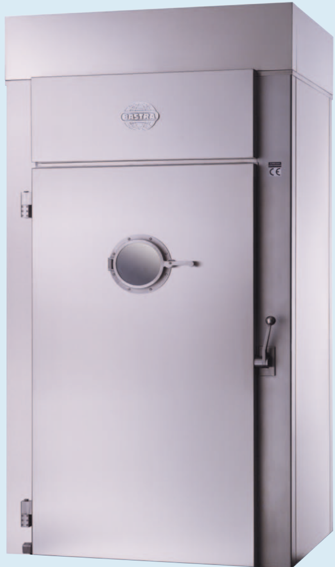
Fig. BASTRAMAT 2000 UF