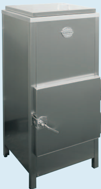
Fig. sawdust smoke generator SMOKE 150